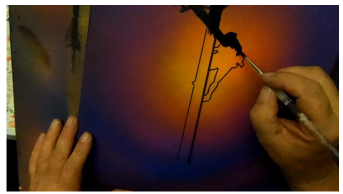
8) Use a #3 round brush to paint in the solid silhouette shape.