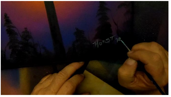
11) Don't forget to sign your masterpiece!