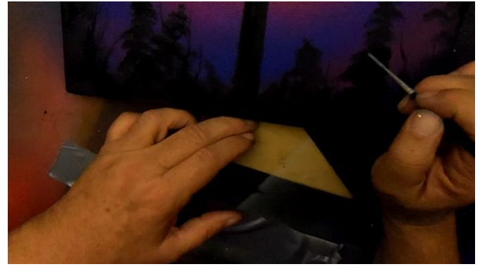
10) Load the script liner with thinned black and throw in some twigs and branches.