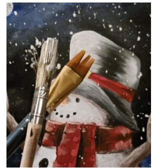
16) Load a large brush with thinned white and tapping against a brush, tap in snowfall dots.