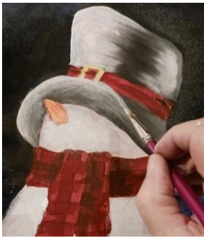
9) Add detail highlights and shadows.