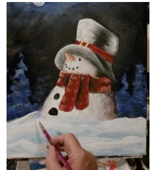
12) Lay in white snow drifts under snowman to 'plant' him.