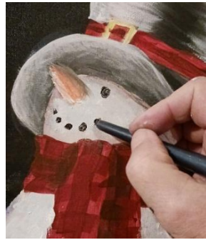
10) Using the back tip of a brush handle, paint black eye and mouth pebbles.