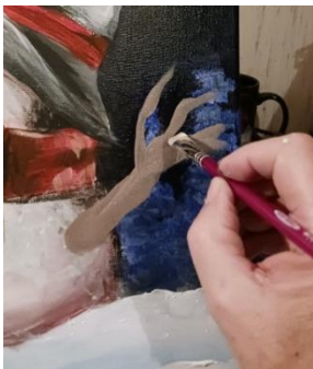
13) Lighten burnt umber with some white and paint the twig arms and hands with small flat.