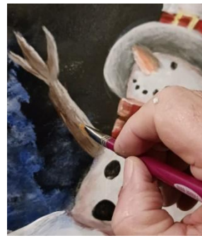
15) Don't forget the other arm!