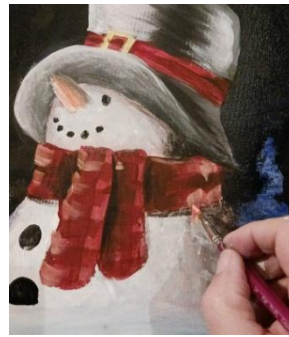
11) Give the snowman shadows using purple/black and 'sparkle' highlights with white.