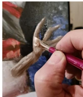
14) Highlight edge facing light source. Deepen shadows with dark umber/black.